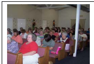
Ladies Day Session